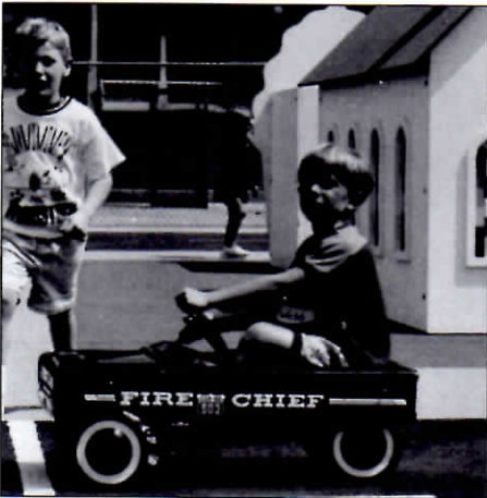
A miniature village helps kids practice their safety lessons.

Each summer, 4- and 5-year-old children have spent a week in the classroom learning all kinds of safety messages — from stranger danger to pedestrian safety. Then they put their new-found knowledge to the test.